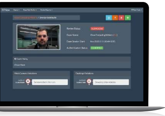
Proctored exam results with flagged violations in LMS